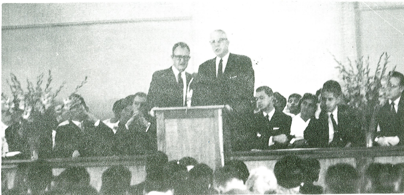
GUATEMALA STAKE CONFERENCE PRESIDED BY ELDER STERLING W. SILL---OCT 15